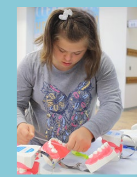
Students learn important health skills at Varied Abilities Days.

High School Transition Fairs offer a supportive pathway to independent living. Organized and initiated by AWS Foundation, fairs help parents, educators and students tap the right resources and opportunities for successful next steps following graduation.