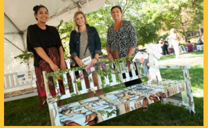
designed by 10 local artists were introduced to area playgrounds to help teach the importance of friendship and inclusion at an early age.